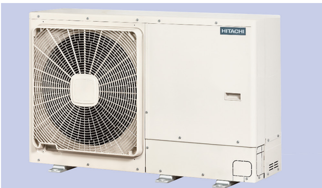
5. Qual-Pex Eco Air to Water Heat Pump