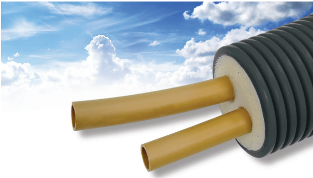
1. DUO ECO PIPE

There are no special tools or fittings required as the 1" Qual-PEX Plus+ 'Easy-Lay' pipes will fit with standard 1" compression fittings that can be bought in any Hardware outlet. Simply dig your trench, lay the pipe in a serpentine pattern in the trench and back fill with sandy clay. Allow 1% of the length of the pipe for expansion and contraction. Best practice would be to anchor the pipes at all fitting locations