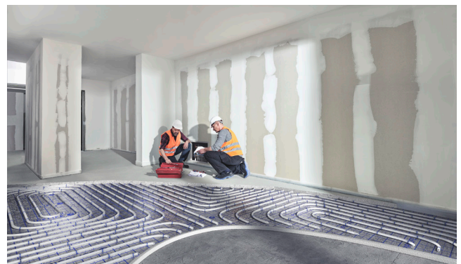
4. Qual-Pex Underfloor Heating