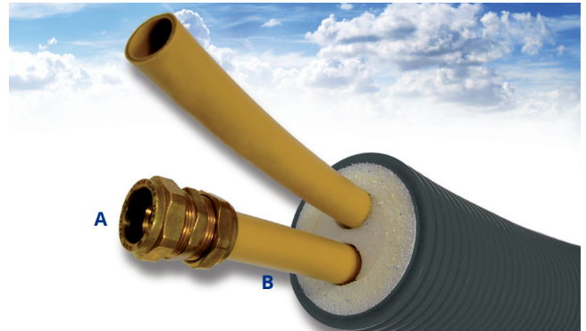
2. A) 1" Standard Compression Fitting B) 1" Irish Size Qual-PEX Pipe